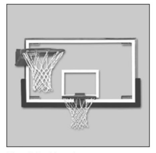
Rims & Backboards

The Spring Assisted Mechanism and patented Dynamic Sub Frame simultaneously lift, position and balance the goal at precise playing height in one easy movement. Patent #5628508